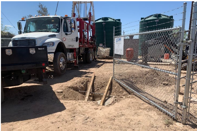
Well Rehabilitation In-Progress