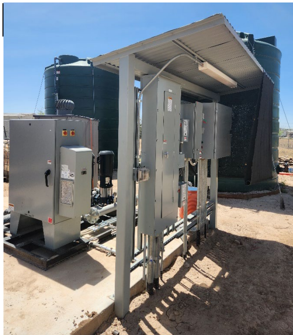
New Tanks and Electrical Equipment

Global Water will be holding a virtual town hall on May 10, 2023, at 6:00PM to further discuss the rate case process. To attend please visit