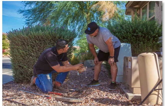
Meter Replacement Project